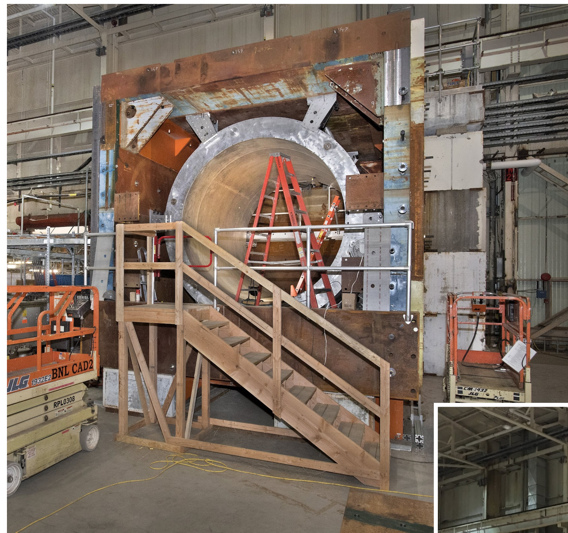
sPHENIX temporary flux return in Bldg. 912